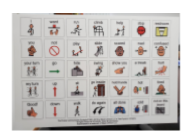
3'x2' sign - retail $180

Provide individuals <sup>3'x2</sup> with communication needs the opportunity to have a voice!